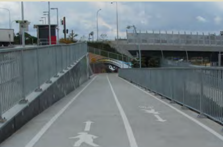
New shared use paths will be constructed as part of the project.