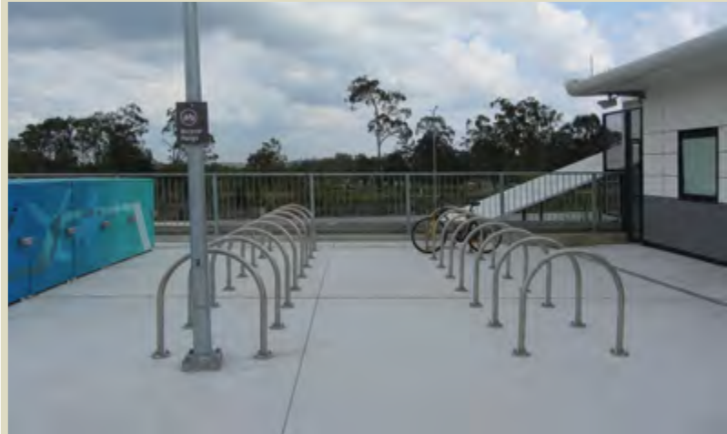
External bike racks will be located at both stations.