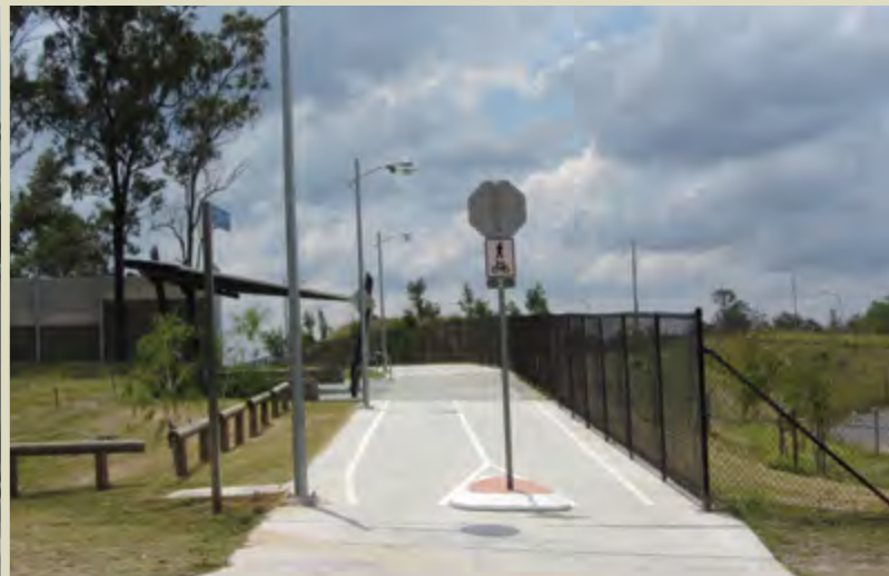
The existing shared path at Julie Road, Ellen Grove.