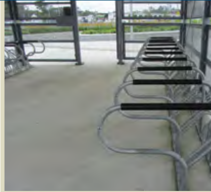
A 50 space secure bike cage will be provided at Springfield Station.

Springfield Station will have a 50 space secure bike cage and 50 bike racks. Springfield Central Station will have a 100 space secure bike facility integrated into the station building. It will also have 20 bike racks and end-of-trip amenities including toilets, showers, change rooms and locker facilities.